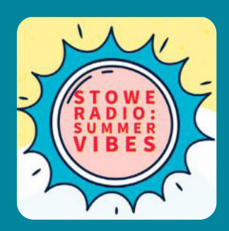
Click on the logo to listen